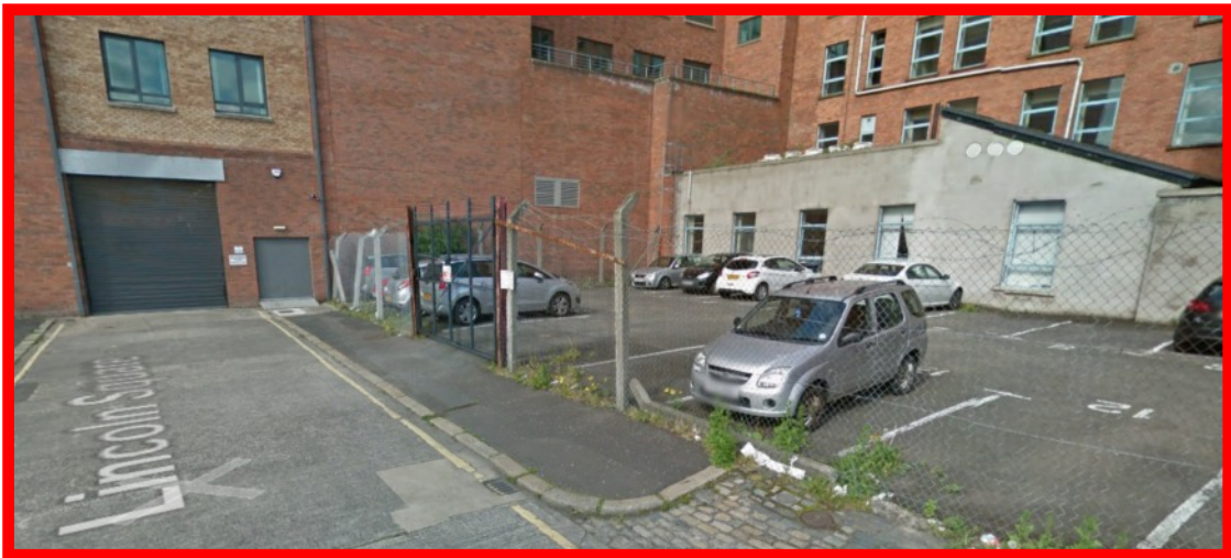
Lincoln Square, Belfast

For further information regarding availability please contact Campbell Cairns:-