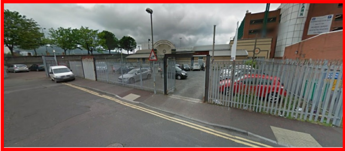
St Andrews Square North, Belfast